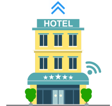
HOTELS SERVICES (IN THE LIBERATED TERRITORIES)