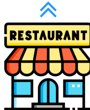
PUBLIC CATERING ACTIVITIES